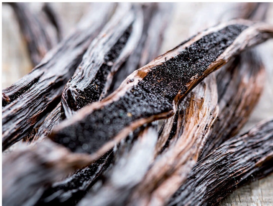
Natural vanilla. The name comes from the Spanish »vainilla«, small pod.

The substances should therefore first be separated from each other, after which isotopic ratios of the target compounds as well as of accompanying compounds when needed can be determined (Compound Specific Isotope Analysis, CSIA).